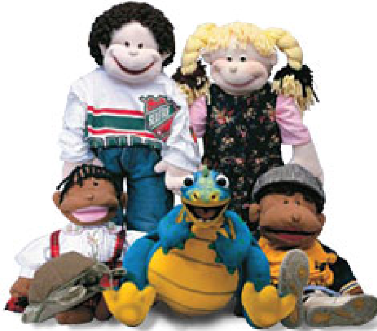
"The Incredible Years" puppets help in therapy

The Masonic Grand Lodge, Auckland has provided funding for Child Mental Health Services to introduce The Incredible Years programme to reduce challenging behaviours in children aged three to eight years, and increase their social and self-control skills. With the use of puppets, intervention manuals and DVDs trained therapists promote children's social competence, emotional regulation and problem solving skills and reduce their behaviour problems.