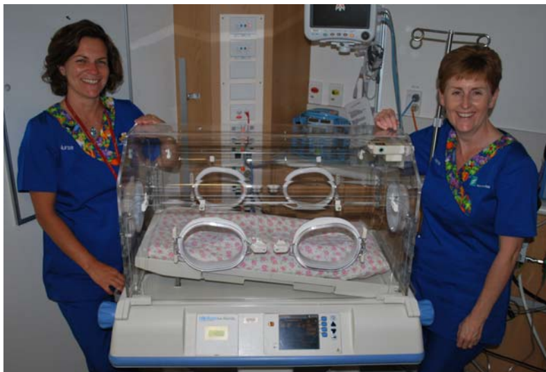
SCBU specialist RN's with an Isolette incubator