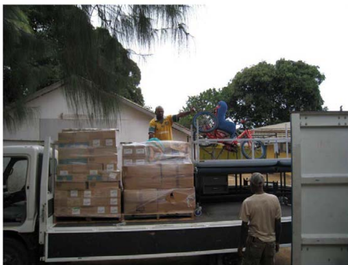
Medical aid unloading in Vanuatu.

A large shipment of medical equipment and consumables was shipped to the island of Vanuatu in the South Pacific with the assistance of Rotary International World Community Service Committee. Medical monitors, mobility equipment, and a large amount of boxed syringes and needles were included in the shipment. It will be distributed from Port Vila to hospitals and clinics across the many islands in Vanuatu.