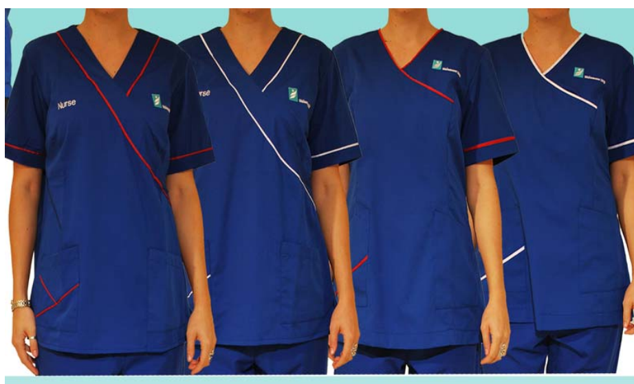
New look Nursing uniforms

The new look features trousers, scrub shirt, tunic and loose jacket which come in differing colours to differentiate and represent individual departments and positions.